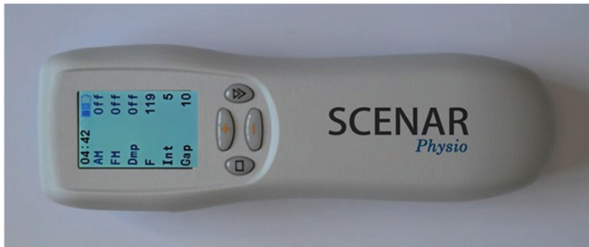
Figure 1. NAE device.

group underwent the same procedure for readings of conductivity skin reaction (time-impedance-type values) and the therapy stimulation phase with the sham device. Treatments were always carried out at the same times by a therapist with experience in handling the SCENAR device (Transdermal Electrostimulator SCENAR class IIa, CE-2265 Operating Manual. Version 7.2–02, May 2018).